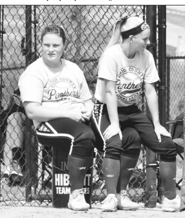
The current Lady Panthers may have been guilty of underestimating