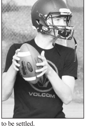
to be settled.

pressure of live action. He will also be using this After keeping everyone Friday night to help determine some starting jobs that have yet